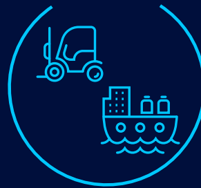
Transport & logistics